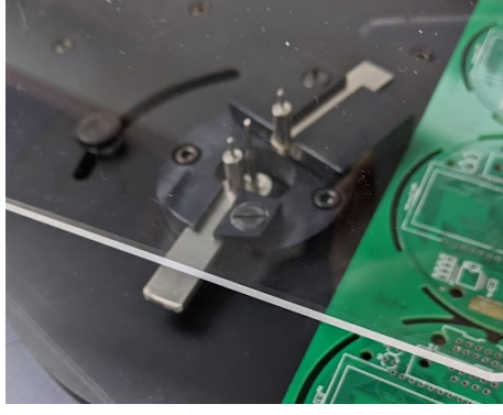
Standard tooling for singulating round or rectangular tab routed panels consists of a rotating plate with a back set block for holding a guide pin mounted on an adjustable slide. The front fixed set block holds the front guide pin. By rotating the rear guide pin the operator can match the radious of any round pcb to all 3 points. Placing the tab between a guide pin and the router bit allows the tab to be moved into the bit for clean board separation.

The standard machine comes with one set of guide pins and the desired router bit for routing .092" or .064" routed channels. Other sizes are also available. The height of the router bit is adjustable by means of a crank on the side of the machine which brings the entire spindle up or down. Bit replacement is done quickly by bringing the spindle up from the machine